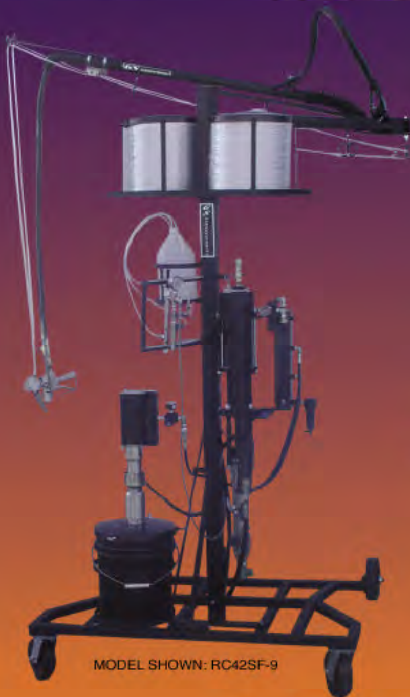
MODEL SHOWN: RC42SF-9

NON-ATOMIZED - FLAT PATTERN - SINGLE ORIFICE PROVEN RELIABILITY