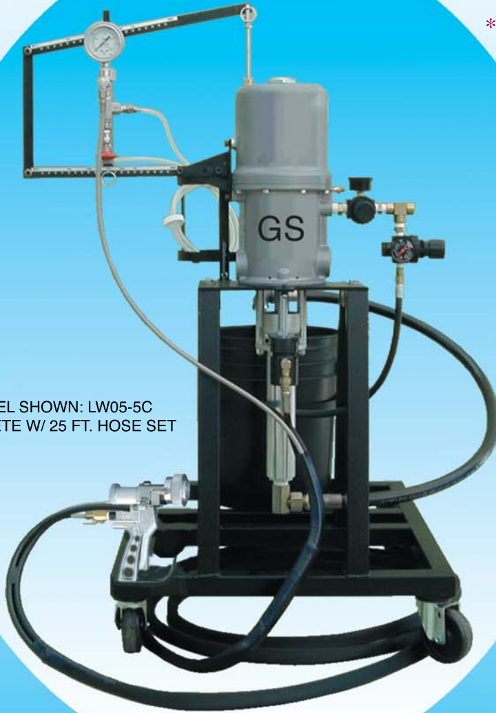
MODEL SHOWN: LW05-5C COMPLETE W/ 25 FT. HOSE SET